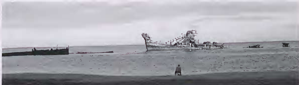
FIG. 1. Tangalooma Wrecks, Moreton Island, Moreton Bay

These artificial reefs were surveyed for the first time in May 2005 for scleractinian coral cover and species presence. Three 20 m point